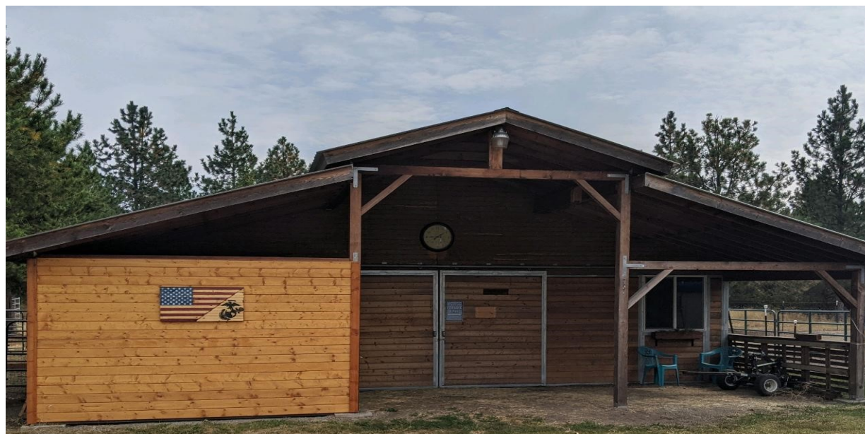
Left photo: Non-member rock barn in the Silver Valley. Top photo: PBCH members Dorine and Steve Souther's barn.